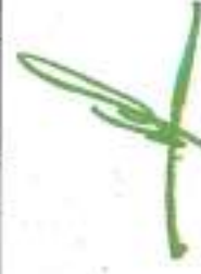
Director South Zone Cultural Centre Thanjavur