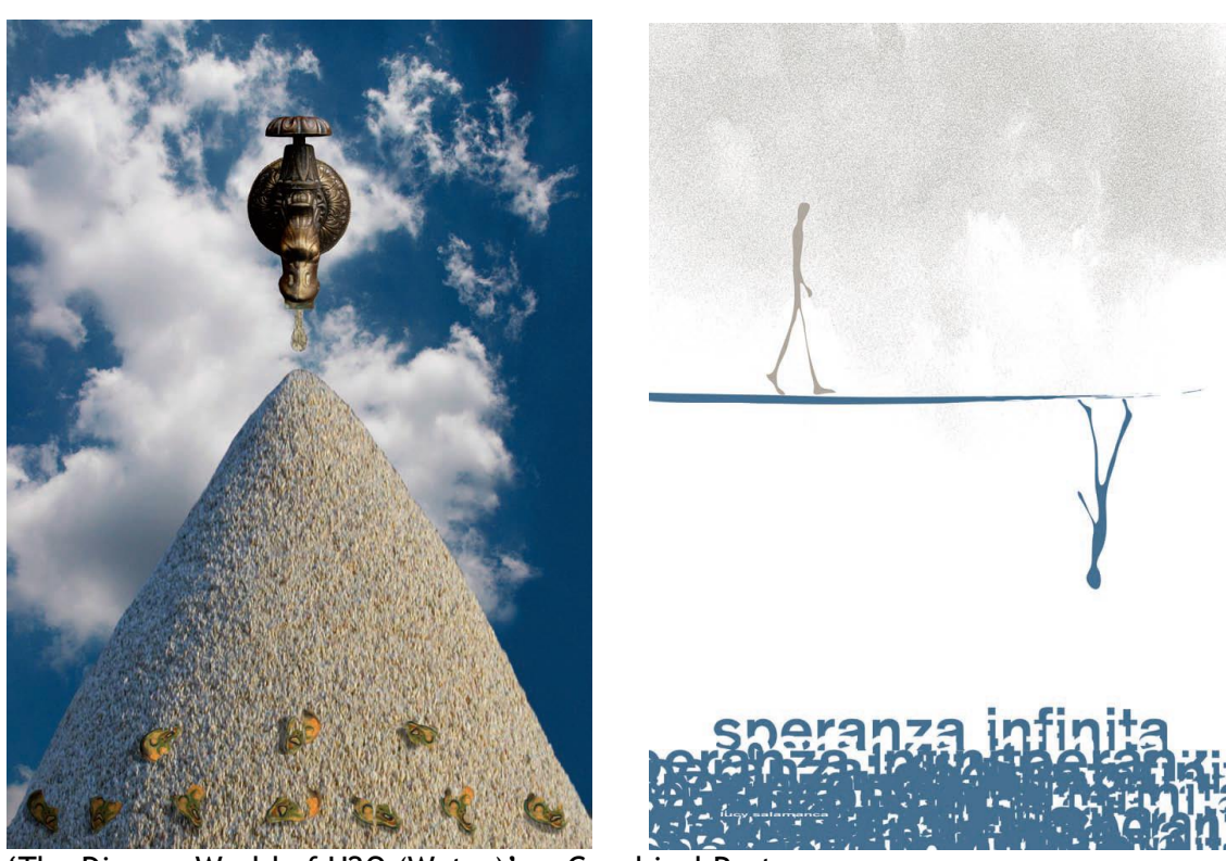
'The Diverse World of H2O (Water)' as Graphical Posters