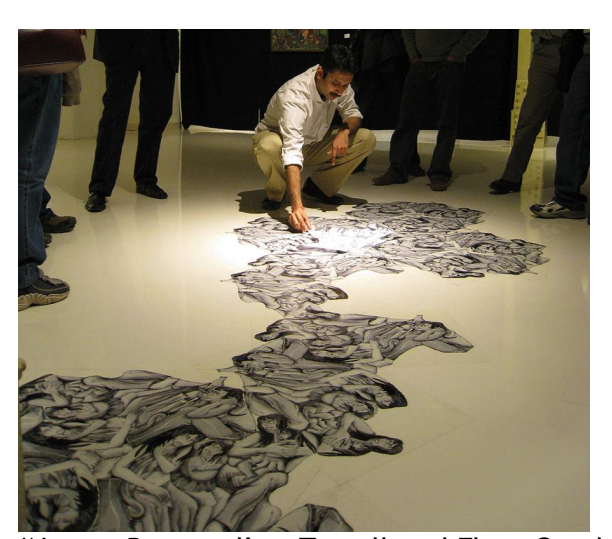
'Nature Restored' as Tessellated Floor Graphics