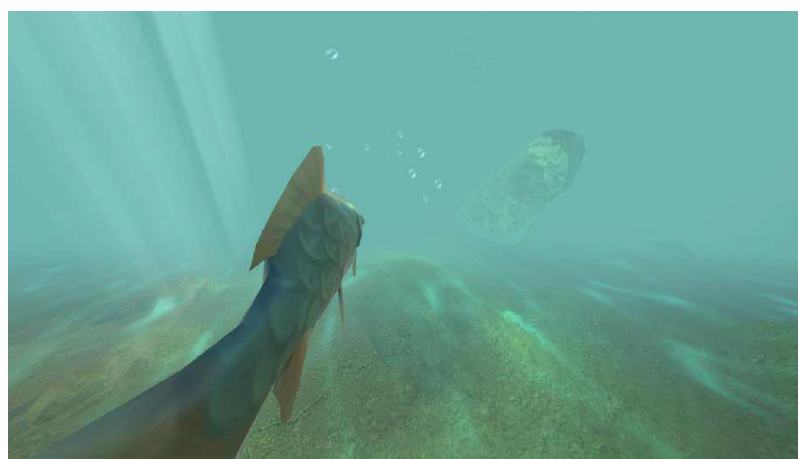
'Point of View' - the fish's view of water as Digital Walkthrough