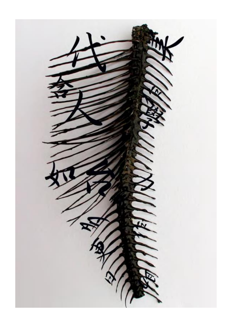
'Messages on Nature' as Typographic/Calligraphic Scrolls