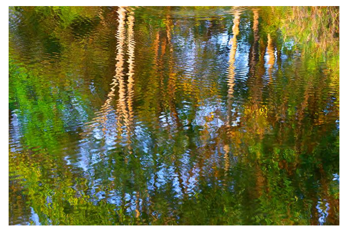
'Narratives on Nature' as still photography and Augmented Reality (AR)