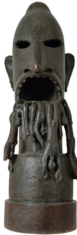
(b) Mahakala Painted plaster of Paris, 1958 106.7 x 34.3 x 35.6 cm