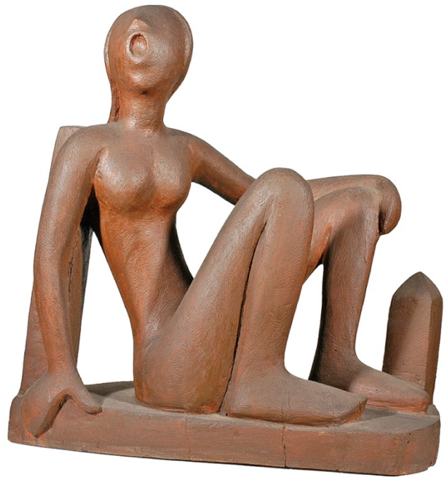
(f) Cry Painted Wood, 1975 69 x 32 x 70(h) cm