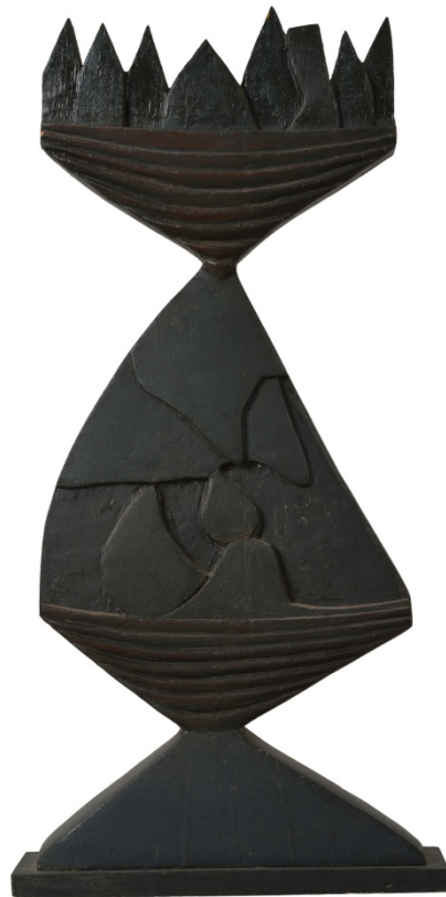
(h) Image Triangle Wood & Oil Paint, 1971 82 x 9.5 x 40 cm