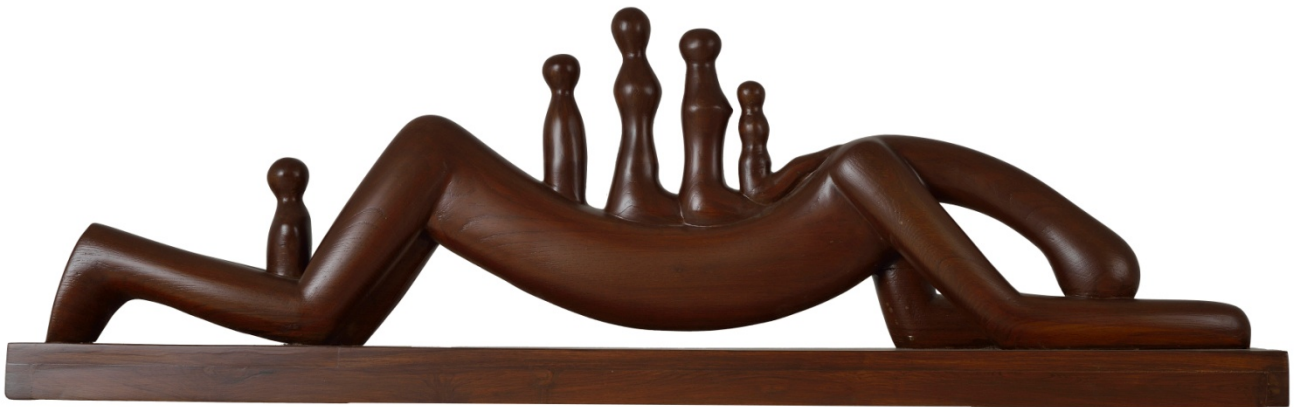
(k) Family horse, Wood 30.5 x 15.5 x 119 cm