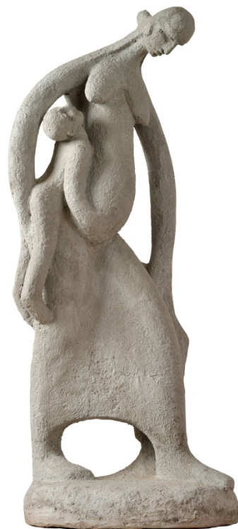
(d) Burden Reinforced Concrete, 1953 115 x 47 x 49 cm