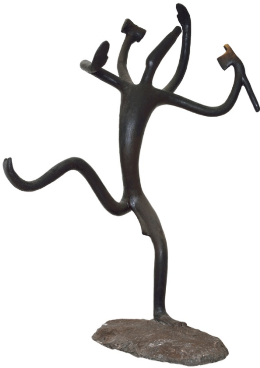
(a) Shiva dance Plaster of Paris and oil colour, 1956 188 x 132 x 92 cm