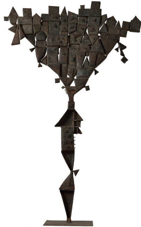
(j) Queen Welded Metal Sheet, 1967 161 x 99 x 23.5 cm