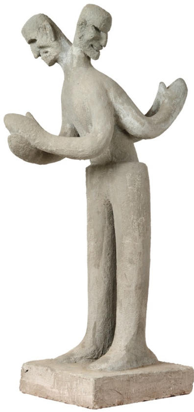
(e) Dual Personality Reinforced Concrete, 1953 137 x 77 x 46 cm