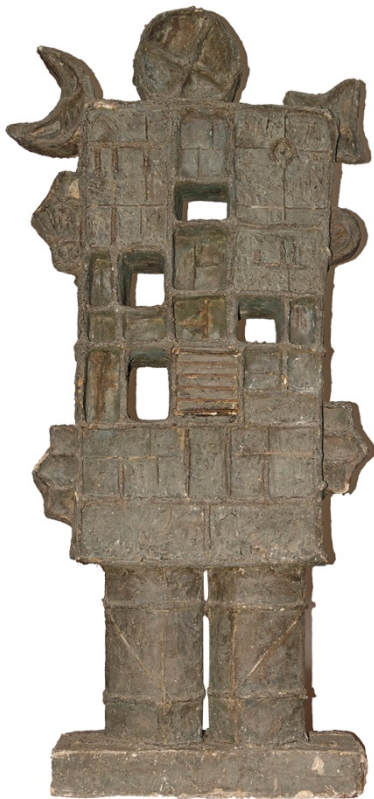
(g) Comic Man Concrete and Plaster of Paris, 1963 171 x 81 x 22 cm