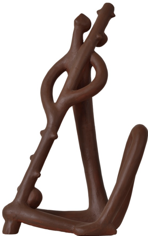
(c) Musician Concrete, 1965 137 x 33 69 cm