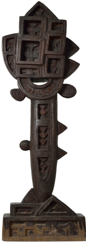
(i) Monarch Wood, 1976 117.5 x 13.5 x 28.5 cm